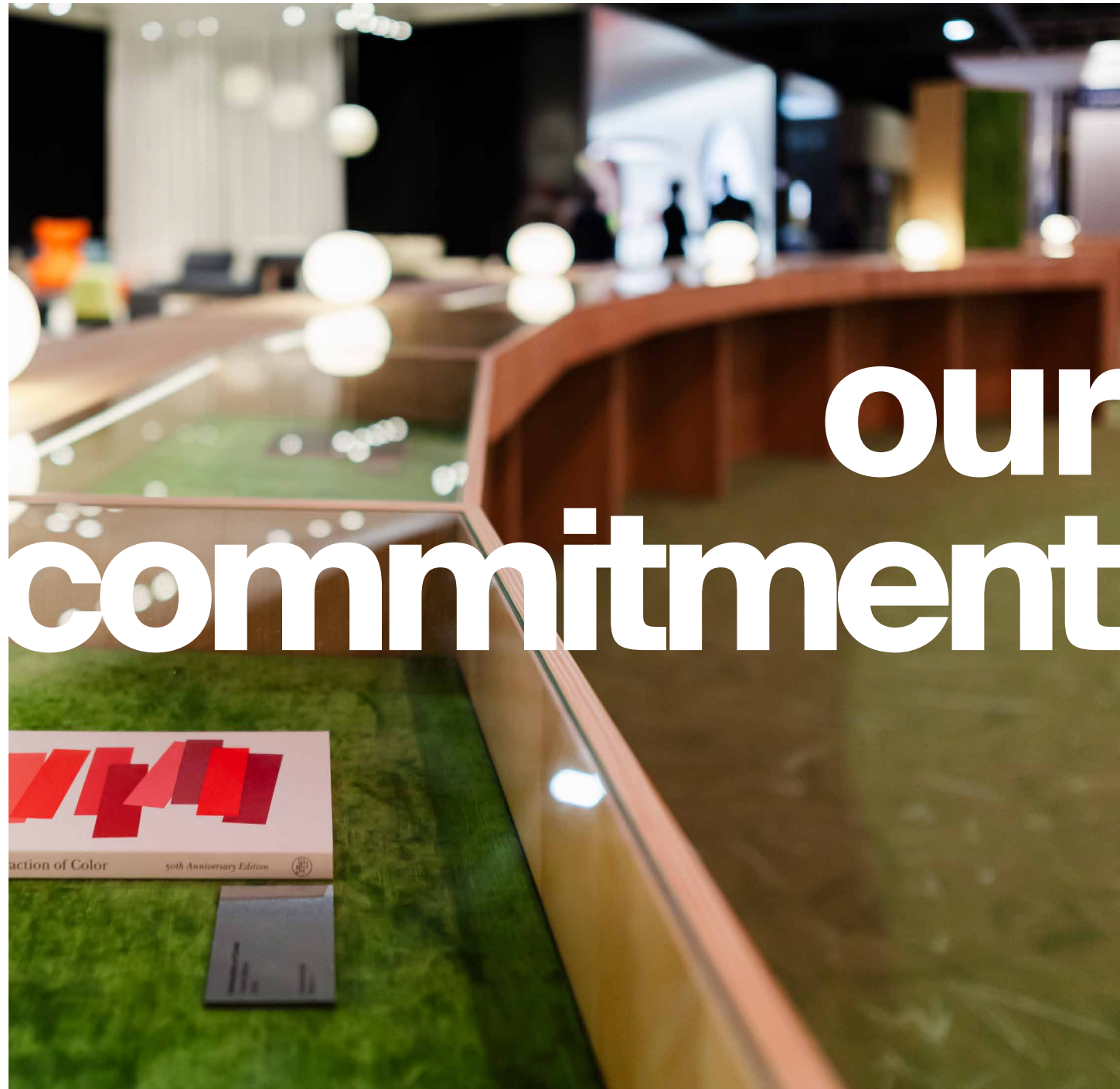
"Salone's Library" / Formafantasma

Formulation of Guidelines for the sustainable planning and production of trade fair installations.