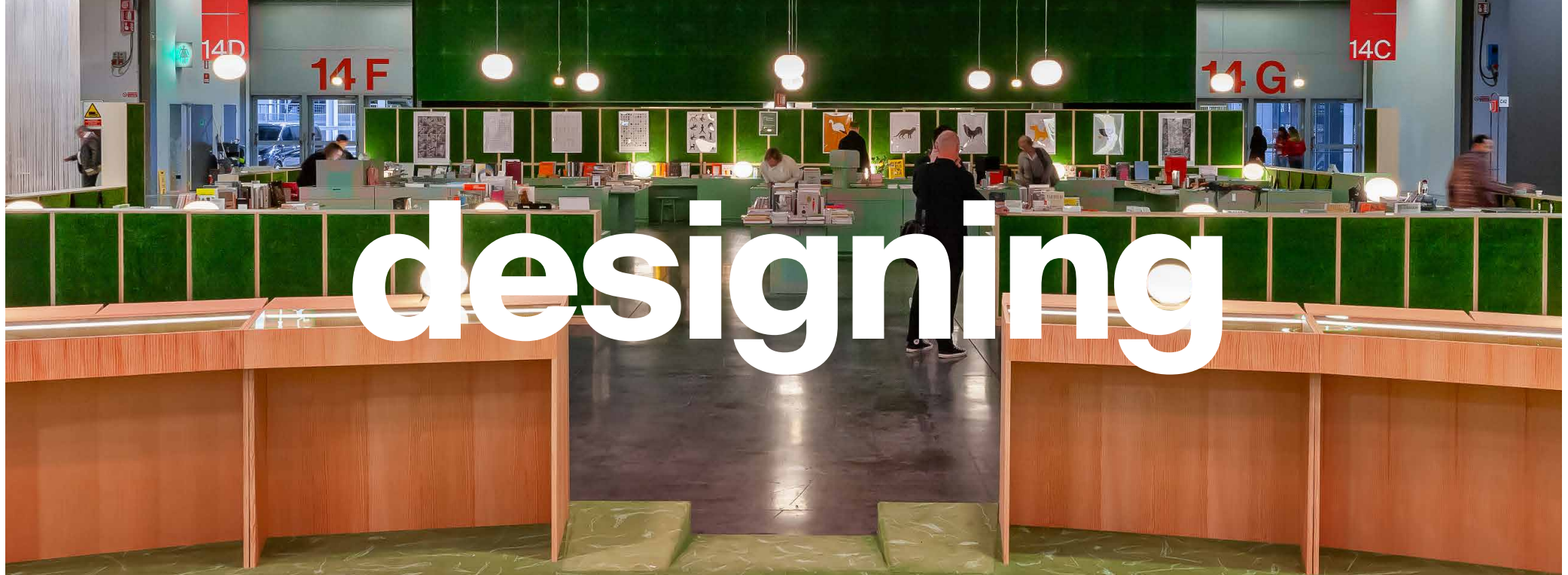
"Corraini Bookshop Mobile" / Formafantasma