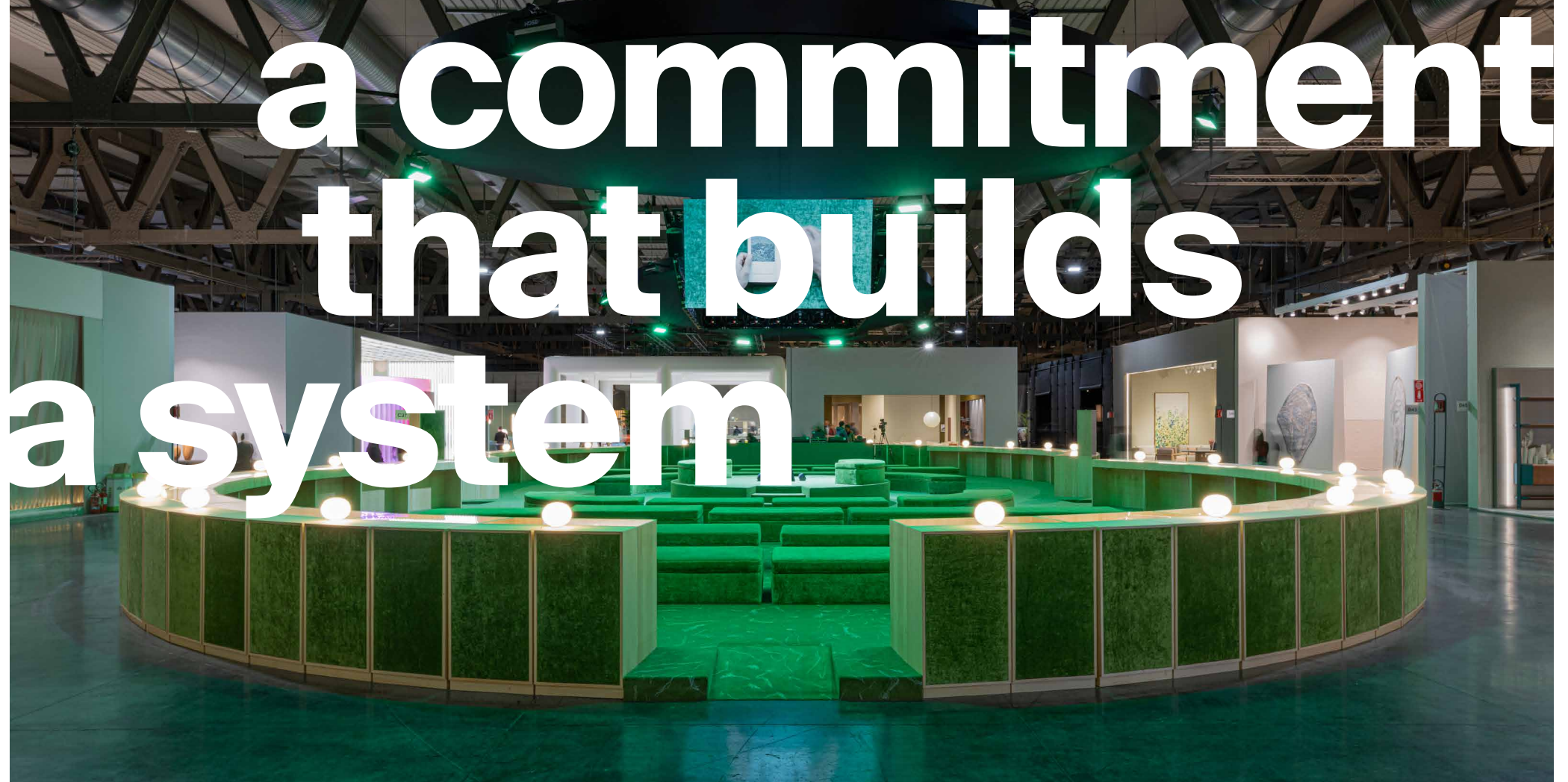
"Drafting Futures" Arena / Formafanstasma

The 2026 edition of the Salone del Mobile.Milano again aspires to being a real benchmark for installation sustainability . Not just a display area, but a laboratory that sets the standard, guides choices and offers exhibitors concrete tools for turning ambitions into results .