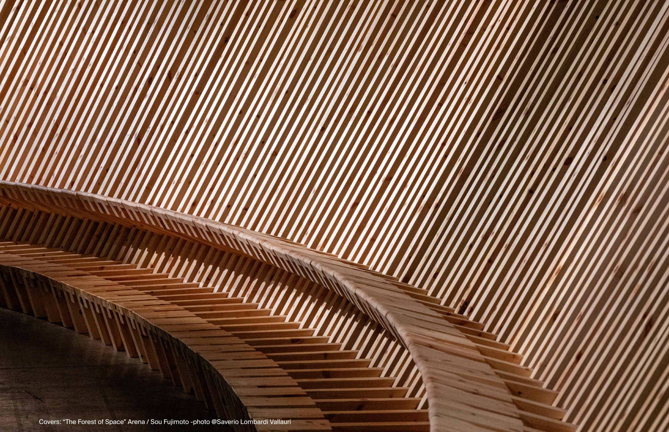
Covers: "The Forest of Space" Arena / Sou Fujimoto